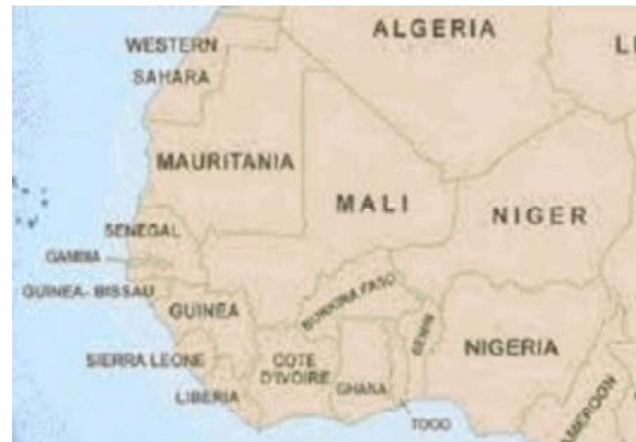
Fig. 1: Map of West African countries taken from https://www.google.com.pk [7] (Nigeria, Liberia, Sierra Leone, Guinea)

Sierra Leone: In Sierra Leone, a total of 717 suspect and confirmed cases were reported by the Ministry of Health and Sanitation of Sierra Leone includes 298 (41.56%) fatal