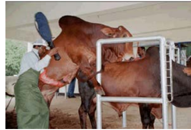
Fig. 1: Collection of semen with the artificial vagina. The left hand touches only the preputial skin, not the penis itself.

Artificial Vaginas: A 45 cm long outer rubber-barrel with rough inner rubber liner that is not spermotoxic is recommended. The inner liner should periodically be checked for possible leakages. The rubber cones should be also is non-spermotoxic and a correctly labeled collection tube should be attached [27]. A jacket for the cone should be provided to prevent breakage and avoid direct exposure to sunlight. Rubber bands for holding on the cones and two ends of the reflected inner lining onto the outer barrel should be strong. Sterile and non-spermotoxic lubricant (e.g. KY jelly, which has been tested and found to be non-toxic in diluted form) should be applied sparingly and just before collection (Fig. 1). The lubricant can be replaced by a small amount of diluents to moisten the entrance to the artificial vagina [28].