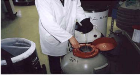
Fig. 3: Transferring of semen from the tank to the thawing water