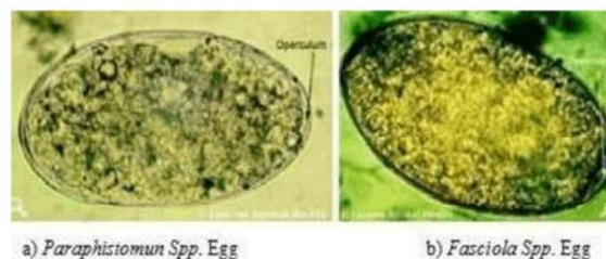
Fig. 3: Rumen and Liver Fluke Eggs

Necropsy: The detection of adult flukes in the liver at necropsy is the most reliable method to confirm fasciolosis. Prevalence studies should be based on abattoir survey other than coproscopic investigation [16].