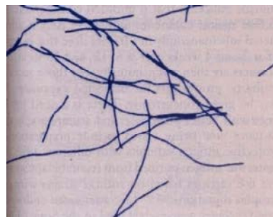
Fig. 1: Morphology of Bacillus anthracis [7]

Bacillus anthracis belongs vegetative cells, impeding the host's immune response [9, 6]. The vegetative Bacillus anthracis cells are gram positive; therefore they contain an extensive peptidoglycan, s-layer protein. Cell wall polysaccharides functions in a coating the protective s-layer to cell wall [10].