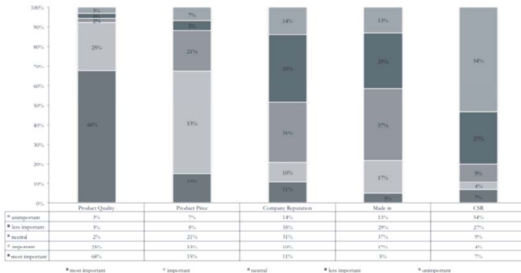
Fig. 1: Consumer preferences when buying products.

Yet ethical behavior of the production company is more important for men respondents when buying products and they take into account more often the production company's social responsibility than women. 65% of women and 72% men consider product quality as the most important factor when purchasing products. Product price is the most important for 13% of women and 18% of men, whereas 22% of women and 18% of men are indifferent about it. Company reputation is considered as the most important factor for 11% of women and 11% of