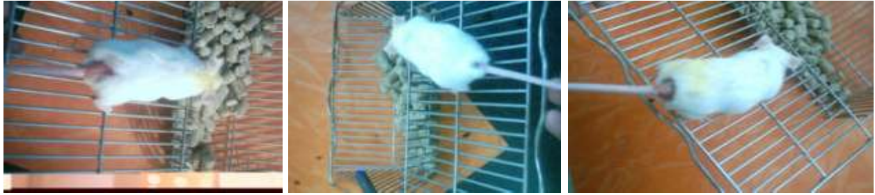
1-From Case Group