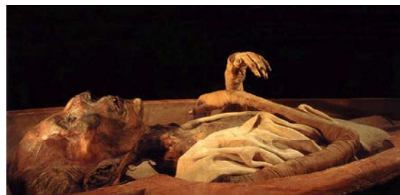
Fig. 11: The Mummy of Ramesses II (c. 1279- 1212 BC), Pharaoh of Moses, in the Egyptian Museum, Cairo