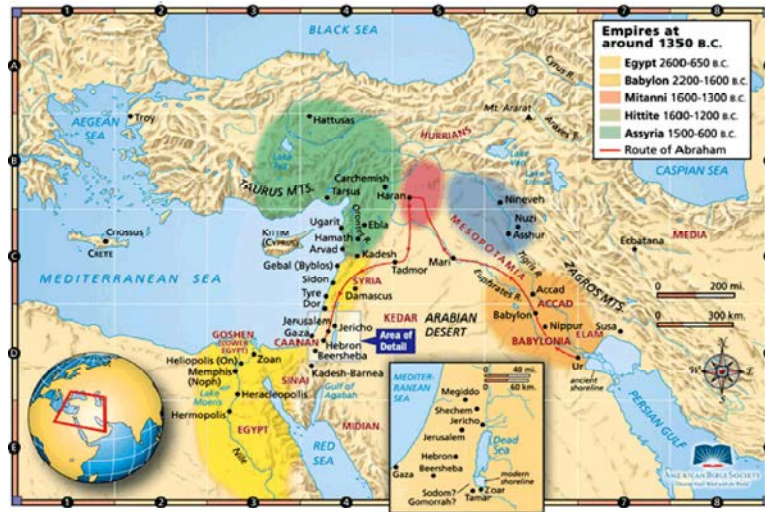
Fig. 1: Map shows the ancient Near East

archaeology. The Holy Book mentions various ancient places, Prophets, people and events that took place, although only a few of these have been uncovered by archaeology.