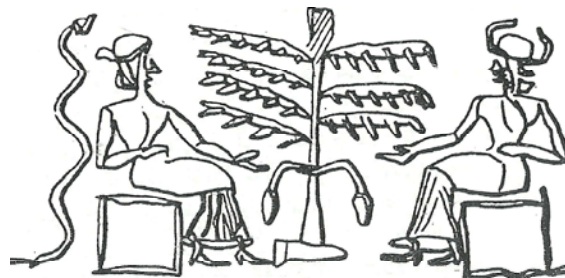
Fig. 10: Sumerian cylinder seal shows Adam and Hawwa and snake behind Hawwa

From archaeological point of view the story is depicted on one of the Sumerian cylinder seal that shown the serpent standing behind Eve and whispered her to eat- the tree in cylinder seal look like date palm tree- then she Hawwa' started encouraging Adam to eat from that tree. It seems to me that the story of Adam and Hawwa was transfer from one generation to another until reach to Sumerian in the third millennium BCE (Fig. 10).