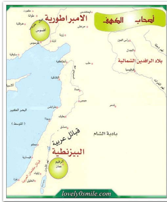
Fig. 7: Map shows the location of Ashab Al Kahf

The Archaeological Evidence: There are two views which referred to the location of Ashab Al- Kahf. Firstly, some allege that it is in Ephesus, Turkey. This is the common allege between the Muslim historian and interpreters whom a doubt the Christian story that the Ashab Al Kahf in Ephesus. On the slopes of Mount Pion (Mount Coelian) near Ephesus (near modern Selcuk in Turkey), the "grotto" of the Seven Sleepers with ruins of the church built over it was excavated in 1927-28. The excavation brought to light several hundred graves which were dated to the 5th and 6th centuries. Inscriptions dedicated to the Seven Sleepers were found on the walls of the church and in the graves. This "grotto" is still shown to tourists.