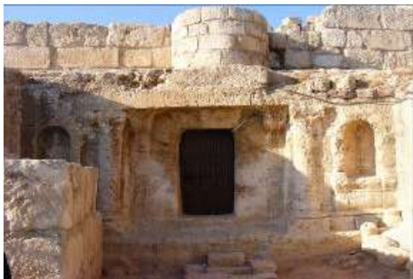
Fig. 9: View of entrance Ashab Al Kahf in Amman, Jordan

The Story of Adam and Hawwa (Eve): Adam and Hawwa' (Eve) lived together in Paradise for a period of time. Allah permitted them to eat from all the fruits of Paradise, except the fruits of one particular tree. Allah allowed them to go from one place to another in the apparent locations of Paradise to eat from the fruits and to benefit from these locations. Adam and Hawwa' (Eve) were not given permission to eat from that tree (the name of the tree is not mentioned) but Iblis was able to whisper to them to eat from it. As the story goes, Hawwa' (Eve) eventually was driven to eat from it and as such started encouraging Adam to eat from it as well. Doing so, they committed a sin Allah warned them from doing, so they became sinful, however it was a small sin and they both quickly repented to Allah as stated in the Qur'an [37].