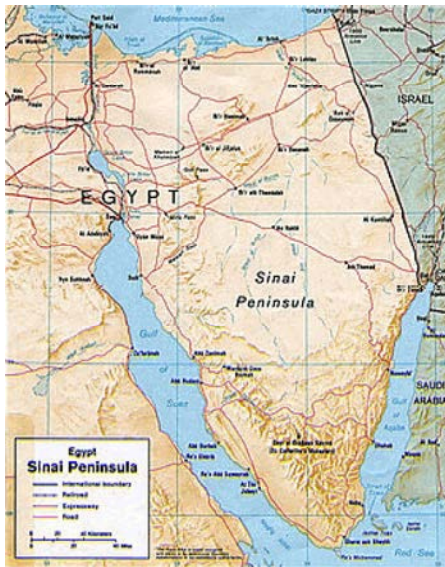
Fig. 5: Map of the Sinai Peninsula with country borders

Gaza: Gaza's history of habitation dates back 5,000 years ago, making it one of the oldest cities in the world [18]. Located on the Mediterranean coastal route between North Africa and the Levant, for most of its history it served as a key entrepôt of the southern Levant and an important stopover on the spice trade route traversing the Red Sea [19].