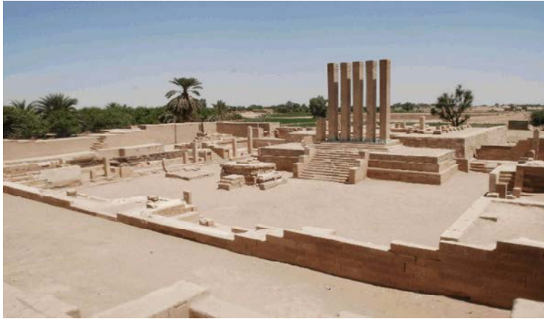
Fig. 4: Saba: Remains of Temple Aum (Mahram Balqes)