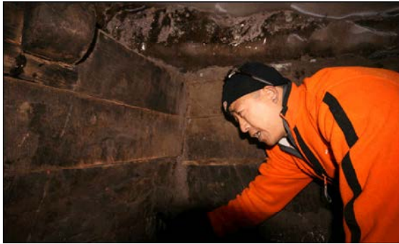
Fig. 13: Remains of Noah's Ark have been found, Researcher examines wooden beams inside 'Noah's Ark'

Noah left the Ark and he and his family and companions built a town at the foot of Mount Judi, named Thamanin ("eighty") in reference to their number. Noah then locked the Ark and entrusted the keys to Shem. Yaqut al-Hamawi (1179-1229 CE) mentions a mosque built by Noah which could be seen in his day. Some modern Muslims, although not generally active in searching for the Ark, believe that it still exists on the high slopes of the mountain.