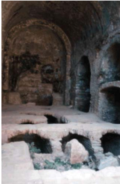
Fig. 8: View of Ashab Al Kahf in Ephesus Turkey