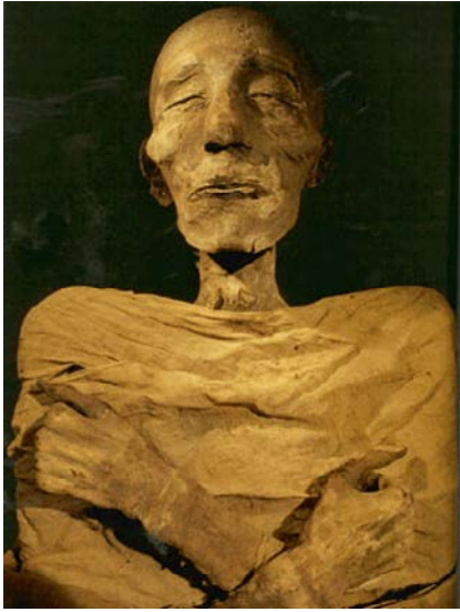
Fig. 12: Mummy of Merneptah (ca.1212 -1202 BCE), Exodus Pharaoh

Moses' Pharaoh's and Mummification [39] (Archaeological and Islamic Sources): Among the many hypotheses, concerning the historical time-frame occupied by the Exodus in the history of the pharaohs, I have concluded that the most likely is the theory which makes Merneptah [40], Ramesses II's [41] successor, the pharaoh of the Exodus. The comparison of the data contained in the Scriptures with archeological evidence strongly supports this hypothesis. I am pleased to be able to say that the Biblical narration contributes weighty evidence leading us to place Moses in the history of the pharaohs. Moses was probably born during the reign of Ramesses II. (Fig. 11) Biblical data are therefore of considerable historical value in the story of Moses. A medical study of the mummy of Merneptah (Fig. 12) has yielded further useful information on the possible causes of this pharaoh's death [42, 43]. The fact that we possess the mummy of this pharaoh is one of paramount importance. The Bible records that pharaoh was engulfed in the sea, but does not give any details as to what subsequently became of his corpse. The Qur'an, in Surah Yunus notes that the body of the pharaoh would be saved from the waters: "Today I will save your dead body so that you may be a sign for those who come after you" [44].