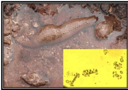
Fig. 5: Holothuria parva (live specimen with spicules of dorsal body)