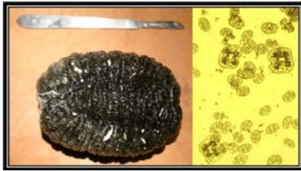
Fig. 4: Holothuria scabra (Preserved specimen with spicules of dorsal body)