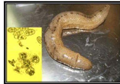
Fig. 2: Holothuria arenicola (Preserved specimen with spicules of dorsal body)

Holothuria (Thymiosica) arenicola ; [21] 145,147; [22] 178, pl. 28, fig. 3; [23] 224-225, 232, fig 4a; [10] 94, fig 50; [24] fig. 1a & b & c & d