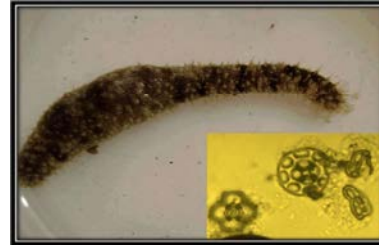
Fig. 6: Holothuria pardalis (live specimen with spicules of dorsal body)