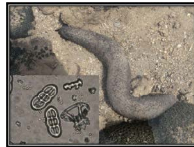
Fig. 3: Holothuria leucospilota (live specimen with spicule of dorsal body)

Remarks: A medium-sized of Holothuria which is known as the Sand Sea Cucumber, is a circumtropical species was found from under intertidal rocks to depth 30m. body approximately cylindrical in shape with the posterior and sometimes the anterior end distinctly tapering; mouth and