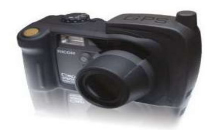
Fig. 1: Used RICOH Capilo 500SE GPS digital camera http://www.korecgroup.com/images/images_img-229.jpg

Used Instruments and Techniques: The main device used here is a stand alone digital camera equipped with a GPS receiver, namely, RICOH Capilo 500SE GPS camera shown in Figure 1. This RICOH Capilo camera -GPS camera - here after, has a solid state CCD (Charged Coupled Device) image sensor of 8.0 Megapixels. It is available with an integrated GPS receiver and a digital compass. A very useful capability of this camera is that the latest GPS information is retained in the camera for ten minutes whether logged or not on GPS satellites. This enables to acquire GPS information outdoors in the