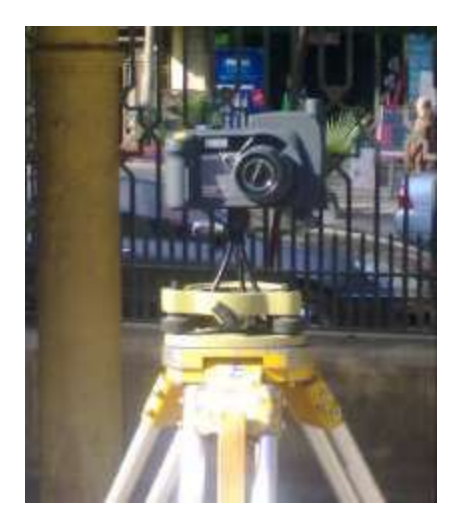
Fig. 5: Fixation of the GPS camera over the tripod

because most data is collected automatically with the GPS camera and GPS PhotoMapper. It should be noted here that, the camera is held over a tripod during capturing the images and fixed in such a way to control its position and orientation, as depicted in Figure 5.