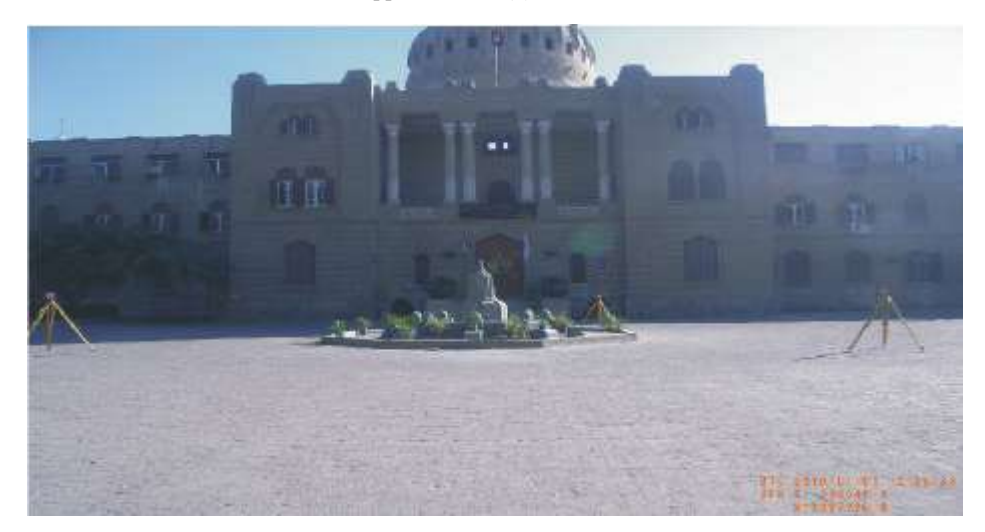
Fig. 4: Digital photo taken at one of the exposure stations