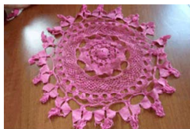
Picture 16. Table cloth

Bademağacı point lace models have been named after the entities in nature. The most popular ones are named after plants (starflower (dahlia), quince, almond lace, pepper