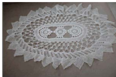
Picture 17. Tray cloth

Bademağacı point lace models have been named after the entities in nature. The most popular ones are named after plants (starflower (dahlia), quince, almond lace, pepper