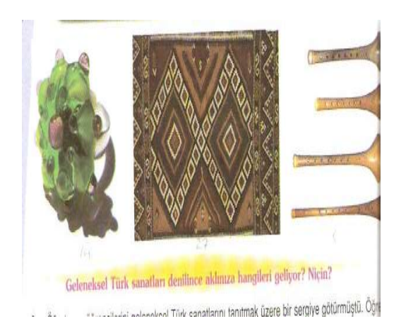
Fig. 5: Community Source (Book IV, pp: 138)

As the Table 2 suggests, in terms of the use of primary sources by the fields of learning, the "Culture and Heritage", about which 56 primary source examples were used in Book I, 27 in Book II, 23 in Book III and 28 in Book IV corresponding to total of 134 primary source examples, has more examples of use of primary sources than any other learning fields in all the books. This field of learning is followed by "Power, Government and the Society" with 26 primary source examples in Book I, 16 in Book II,