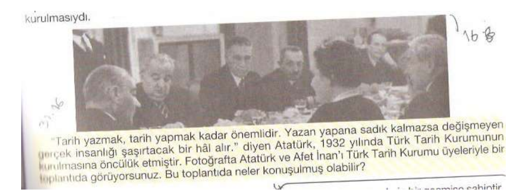
Fig. 3: Image Source (Book I, pp: 29)