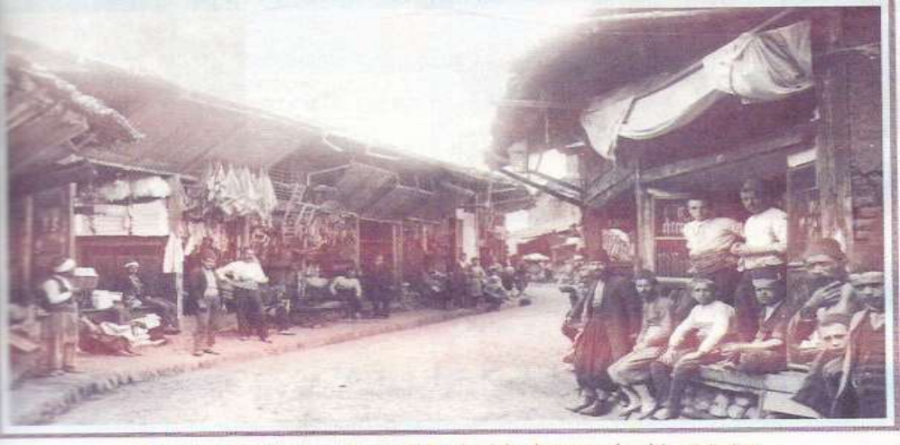
Bursa'nın Büyük Çarşısı'nın 1885 yılındaki durumundan bir görünüm