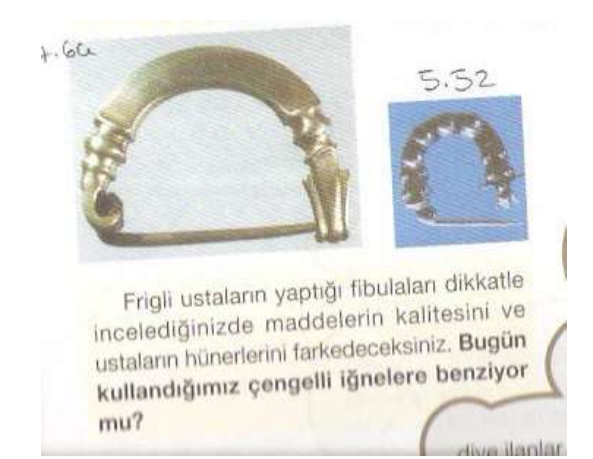
Fig. 1: Object Source (Book I, p: 52)