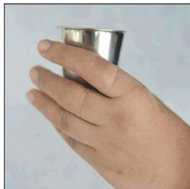
Fig. 9: Final silicone finger prostheses during the function; holding a glass of water

When the patient was satisfied with the wax pattern, it was transformed to the silicone finger prostheses (Silastic, MDX 4-4210, Medical grade silicone elastomer, Factor II, Lakeside, AZ, USA) by curing at room temperature and done external staining (Fig. 7). The prosthesis was delivered to the patient (Fig. 8). He was happy with the esthetic and functional outcome (Fig. 9).