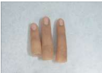
Fig. 7: Final silicone finger prostheses after external staining