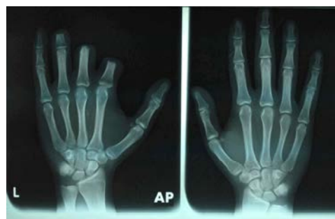
Fig. 2: Radiographic examination done at palmar projection showing defect of the index, middle and ring finger of the left hand