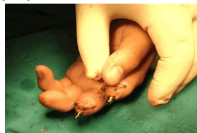
Fig. 4: Placement to the implant and abutment in index and middle finger of the left hand