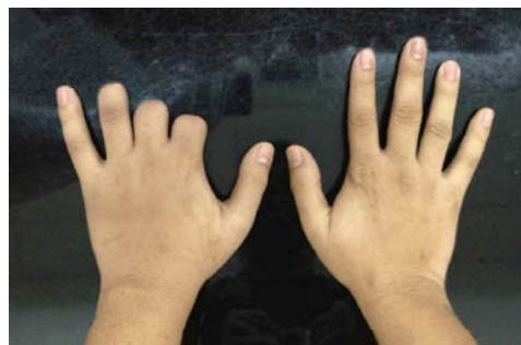
Fig. 1: Preoperative picture of the patient showing the defect of index, middle and ring finger of the left hand

In the 8 weeks follow up, the stability of the implants were noted 72 ISQ by RFA in both fingers (Fig. 5). Then, an impression of the left hand was made with alginate (Jeltrate, Dentsply, York, Pennsylvania, USA) with the implant positioned on the index and middle finger and cast was poured with Type IV dental stone (Lafarge, Prestia, Meiel, France). Then the heat resin (Vertex-Dental, Zeist, Netherlands) substructure was fabricated and attached to the implant over which Wax pattern of finger was made. Then the wax pattern (Carvex TT 100 soft, Carvex, Haarlem, Holland) was sculptured and tried on patient till the patient was satisfied (Fig. 6).