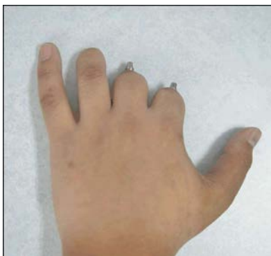
Fig. 5: Healing of soft tissue around abutment at 8 weeks follow up