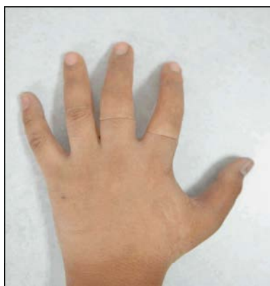
Fig. 8: Final silicone finger prostheses in patient; adhesive retained in the ring finger and implant retained in the index finger and the middle finger of the left hand