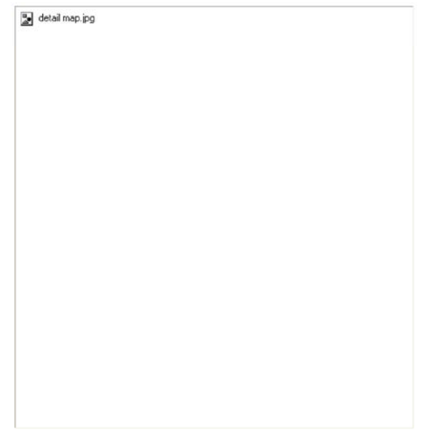
Fig. 3: The spesific map of zona research