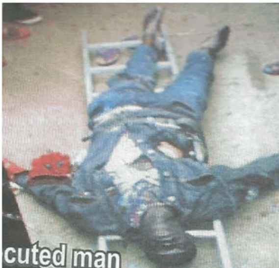
Fig. 2: The Electrocuted man at Agba Abor Isu

Figure 1 showed the man that was electrocuted by high tension voltage at Agba Abor Isu, Onicha LGA of Ebonyi State Nigeria on June 27, 2015. Figure 2 showed the man that was electrocuted at opposite Federal Teaching Hospital (FETHA 2) Abakaliki, Ebonyi State on 25 th September, 2015 [8]. From the research, it was discovered the deceased were contracted to change the phase from the one that has no current to the phase that has light. These areas have power instability and sometimes remained in darkness for days. Because of urbanization, industrialization the transformers in such places are overloaded and the conductors used were weak and it needs total overhauling. The Electricity Generation, transmission and Distribution Company in Nigeria should upgrade some transformers in Ebonyi State and install new ones to meet the demand of the people due to increase in load as a result of increase in population, industrialization and urbanization and this will drastically reduce the power instability and chances of illegal connection. Moreover, the weak conductors should be changed and normal rated conductor be installed according to IEEE Standard.