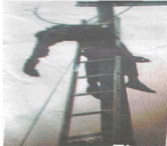
Fig. 3: The man electrocuted at opposite Federal Teaching Hospital, Abakaliki Ebonyi State