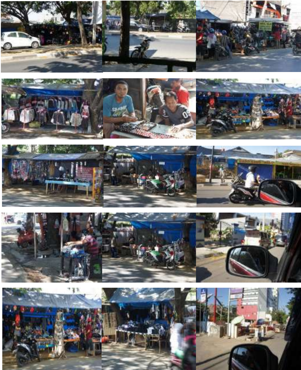
Fig. 2: The existence of Urban Informal Sector Along Hertasing Road Corridor

adequate protection from the economic, social and political sector [13]. Therefore, the existence of economic activities of urban informal sector is very vulnerable to eviction on the grounds of business ownership building built on the public space (pavement) and evolves towards the privatization of public space that should be used for pedestrian lane, but by individuals and community groups it is symbolically interpreted to be utilized in meeting the