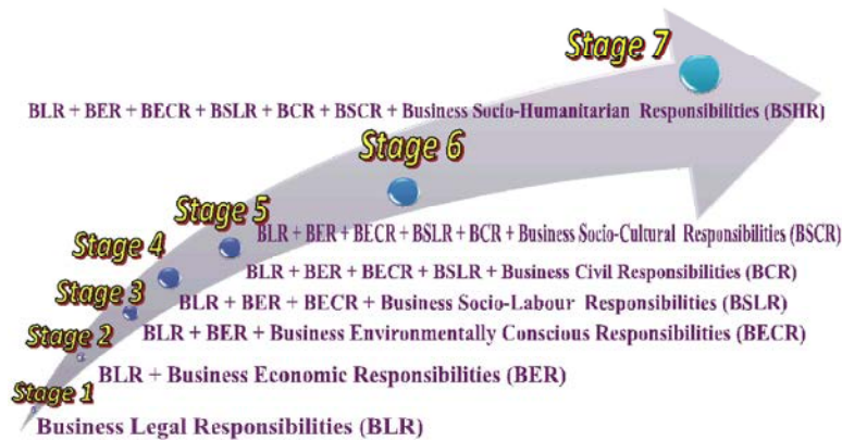
Fig. 1: Evolution of forms of business responsibility

obligations, relation with financial results like a profit increase or decrease, a direct and an indirect effects for business [17]. M. Kitzmueller and J. Shimshack differentiate post-contract, unprofitable and strategic forms of BSR realization [6]. In its turn Carroll's model includes four hierarchically structured types of corporate social responsibility: economic component as profitability and meeting the customers' requirement; legal component as law observance; ethic component as keeping to moral norms and values, philanthropical component as corporate citizenship [18].