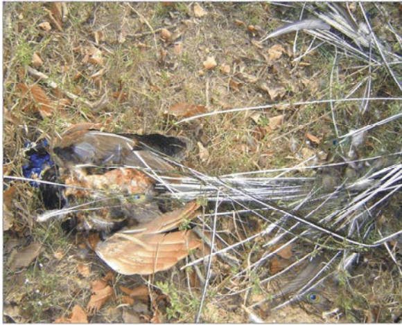
Fig. 2: Pieces of carcass of peafowl at Khara forest of the Rajaji National Park