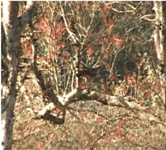
Fig. 3: Eurasian Marsh Harrier sitting over to a tree at Khara forest

All this was happened again in Chilla forest. Harrier being a predator was attacking in a strategic manner; the bird was pitching from air and trying to injure the targeted animal. It was observed that crows were helping the peacock by trying to repel the predator bird. After several minutes, they were disturbed by our presence and suddenly two peacocks slowly arrived nearer to our vehicle and walked away towards the shrub where fighting was ongoing, realizing that they wanted to thank ourselves. Harrier was sitting on a nearby naked tree, I again captured some photographs of the incident. My curiosity had enforced me to reach the spot on foot to document the ground truth behind the incident and there I saw that a nest of peacock was there in the base of