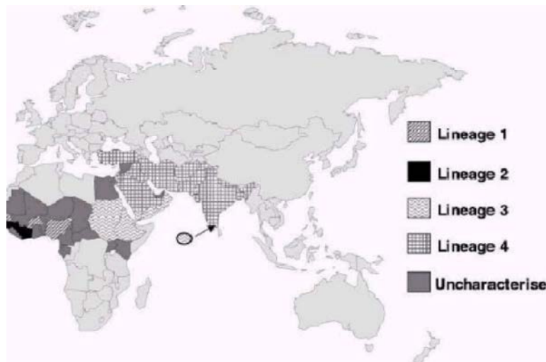
Fig. 3: Geographic distribution of PPRV lineages [40]