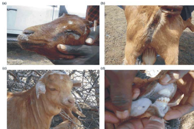
Fig. 2: Clinical signs of PPR [33]