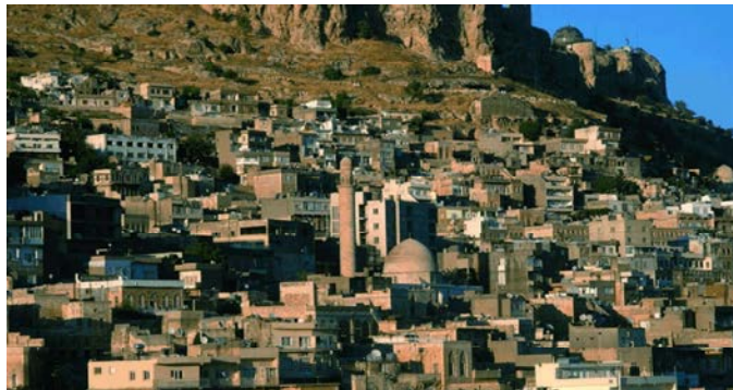
Fig. 3: A general view of Mardin