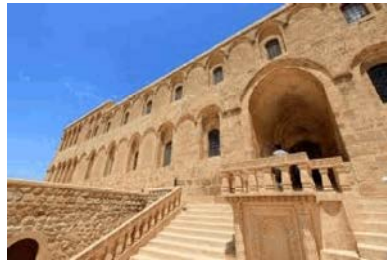
Fig. 9: Deyrulzaferan Monastery