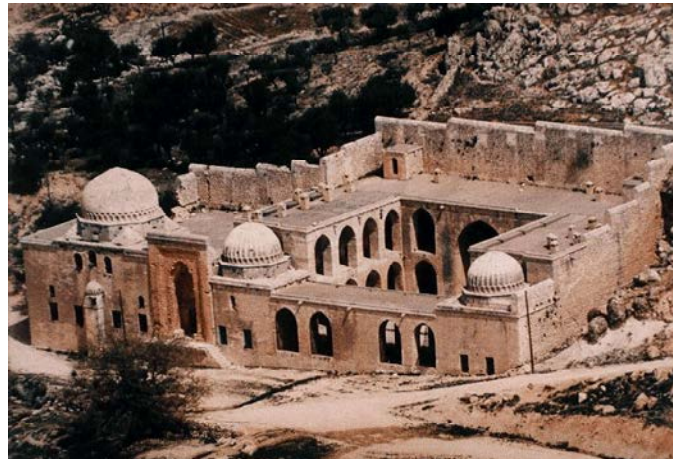
Fig. 4: A view from kasimiye madrasa