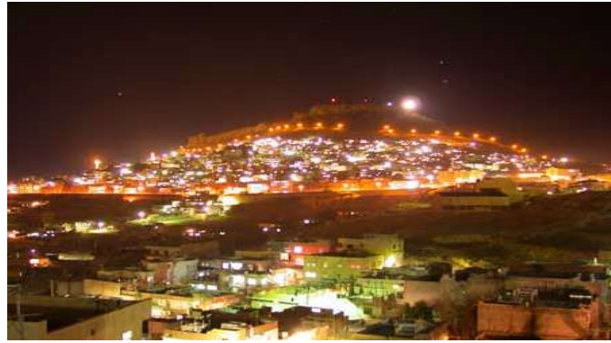
Fig. 5: Mardin's night view