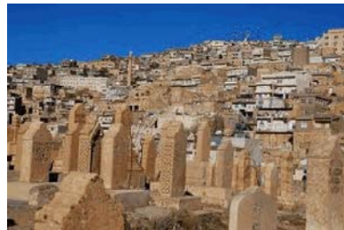
Fig. 10: The view of cemetery in Mardin