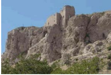
Fig. 1: A view from Mardin castle