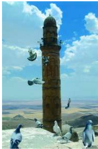
Fig. 6: Historical great mosque and pigeons