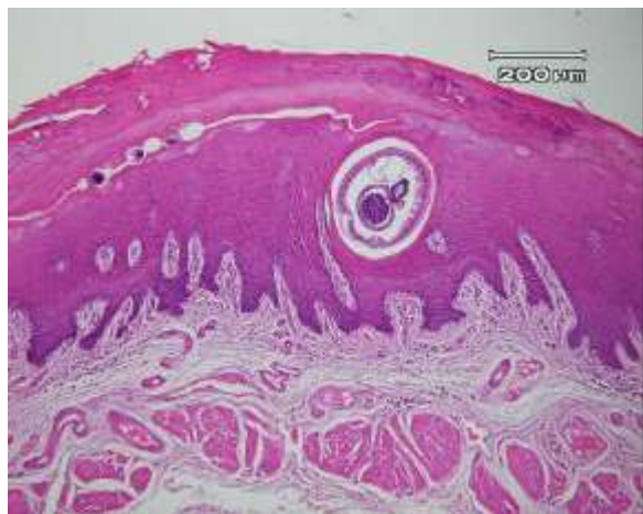
Fig. 1: Gongylonemiasis in sheep: acanthosis, with rete ridges formation, parakeratotic hyperkeratosis (parakeratosis), a burrowed tunnel, with eggshells and debris and without parasite and a cross section of adult helminth lied in burrowed tunnel under the stratum corneum are present. There is a mild eosinophilic inflammatory reaction (HandE, 100 ×).