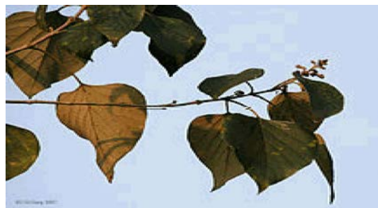
Fig. 1: Gmelina arborea leaves (Gangadharan, 2012).

Serum albumin is the most abundant blood plasma protein and is produced in the liver and forms a large proportion of all plasma proteins. The human version is human serum albumin and it normally constitutes about 50% of human plasma proteins.