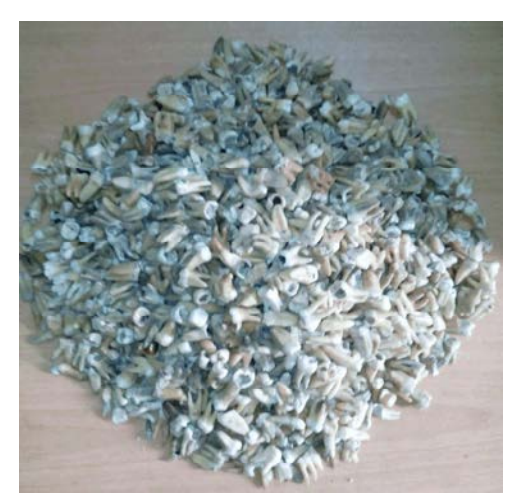
Fig. 1: 1526 extracted upper anterior teeth and premolar