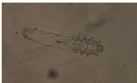
Fig. 1: Demodex mite separated from sebaceous glands surrounding nose