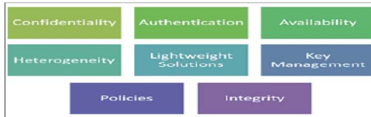
Fig. 2: IoT security principles

Heterogeneity: The IoT connects different entities with contrasting potential, complexity and vendors. The devices even have desperate dates and discharge versions, use desperate technical interfaces and bitrates and are designed for an altogether different functions. Therefore obligations must be outlined to work in a variety of devices as well as in distinctive situations [2, 4, 8]. The IoT aims at connecting device to device, human to device and human to human, thus it implements connection between different things and networks [5]. One more challenge that must be considered in IoT is that the environment is always changing (dynamics), at one time a device might be linked to a completely distinctive set of devices than in another time. And to ensure security optimal cryptography system is needed with an adequate key management and security protocols.