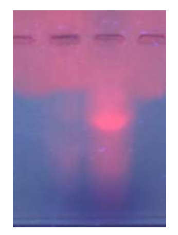
Fig. 3: NaAsO<sub>2</sub> induced DNA fragmentation of fish liver cells

NaAsO<sub>2</sub> for 8 hours, the liver cell DNA was not observed at the position where chromosomal DNA was detected in NaAsO<sub>2</sub>-untreated control fish. This indicated that the liver chromosomal DNA in 1 mM NaAsO2-treated fish was probably fragmented. However, the fragmented DNA was not observed on the lower portions of the gel. This might be due to the formation of very small fragment that were run out of the gel. On the other hand, no fragmentation of liver DNA was observed in 2 mM NaAsO<sub>2</sub>-treated fish sample. The reason behind this was probably due to the necrotic death of the cells by severe toxic effects of NaAsO<sub>2</sub> with higher concentrations. These results suggested that the lower concentrations of NaAsO<sub>2</sub> induced apoptotic cell death; however, higher concentrations induced necrotic cell death. Arsenic induced apoptosis of murine cells or cell lines reported by different investigators [10-12] supports our finding.